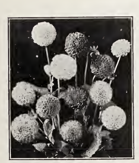
See back pages for Dahlia and other packages.

There is a keen revival of interest in the dainty Pompon varieties. Florists are appreciating their value in basket and make-up work and Dahlia lovers want them in their gardens. We are offering an outstanding variety in each of the leading colors and combinations and all at popular prices.